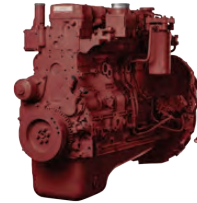
Cummins 5.9L 6B/ISB/ISB02/QSB