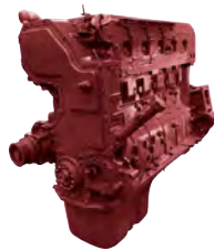
*Cummins ISX 15L CM2250