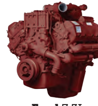
Ford 7.3L IH T444E