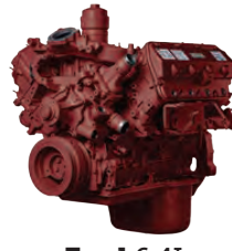
Ford 6.4L IH Maxxforce 7