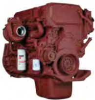
Cummins ISX 15L CM871