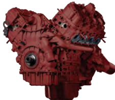
Duramax 6.6L LB7/LLY