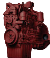
Mercedes MBE904 MBE906/2.7L