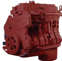
IH DT530 Detroit Series 40