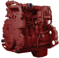
IH DT466 Series: C/P/E/EGR *MaxxForce DT