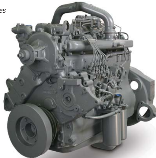
DT-466 C Series

All of Reviva's Complete Drop-In engines are 100% dyno tested prior to shipment. Computer controls ensure that each engine dyno test is conducted under standard, repeatable settings. Every engine is run through a warm up cycle; three separate segments simulating light, medium and heavy throttle conditions; maximum torque and horsepower tests; both high and low idle tests; and a black light leak detection test with dyed oil, coolant and fuel. Reviva also tests oil and coolant temperature; monitors crankcase pressure, oil and turbo boost pressures; and tests fuel consumption.