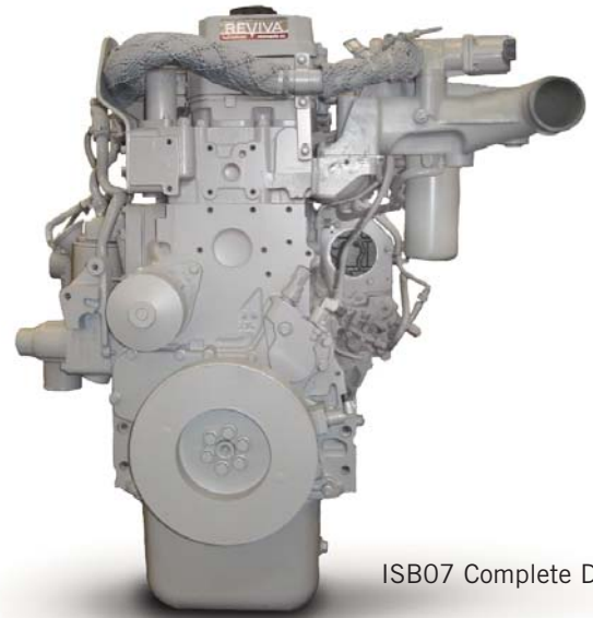
ISB07 Complete Drop-In

All of Reviva's Complete Drop-In engines are 100% dyno tested prior to shipment. Computer controls ensure that each engine dyno test is conducted under standard, repeatable settings. Every engine is run through a warm up cycle; three separate cruise segments simulating light, medium and heavy throttle conditions; maximum torque and horsepower tests; both high and low idle tests; and a black light leak detection test with dyed oil, coolant and fuel.