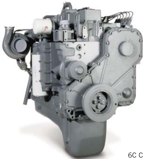
6C Complete Drop In

The CPL and serial numbers are located on the injection pump side of the engine on the front gear cover.