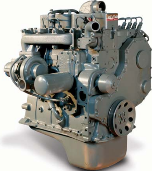
4B Complete Drop-In

All of Reviva's Complete Drop-In engines are 100% dyno tested prior to shipment. Computer controls ensure that each engine dyno test is conducted under standard, repeatable settings. Every engine is run through a warm up cycle; three separate cruise segments simulating light, medium and heavy throttle conditions; maximum torque and horsepower tests; both high and low idle tests; and a black light leak detection test with dyed oil, coolant and fuel.